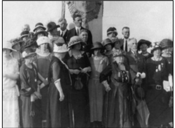
D.A.R. members gather at the Ribault Monument dedication when it was originally placed at Mayport. This image was used in the Mayport film.

The Jacksonville Port Authority recently announced a decision not to pursue the cruise ship terminal at Mayport.