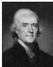
President Thomas Jefferson