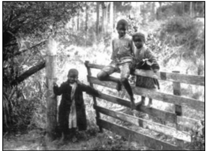
The society's image shown above was also shown in the recent Mayport film documentary.