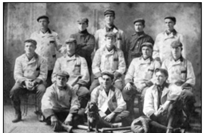
“Take Me Out To The Ballgame” is one of the musical selections for the April program. The image on the left is of the Jacksonville Red Caps team that played at Durkee Field. On the right is the city’s oldest organized baseball team, dating to 1886.